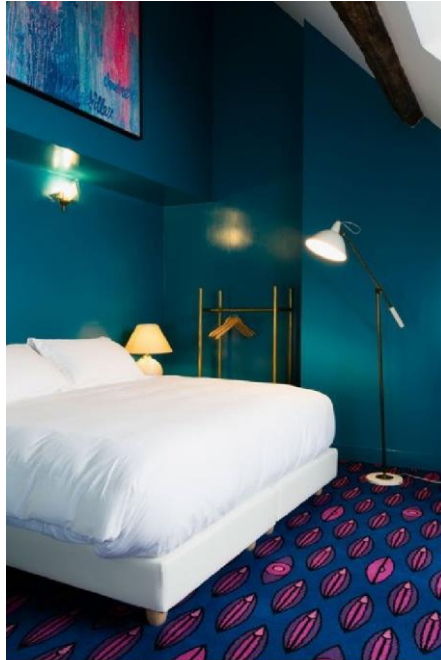
Hôtel Grand Amour

You'd never guess it by the coolly on-trend decor, but you can book this brandnew Left Bank spot starting at just $160 per night. Each of the 50 rooms—created with the contemporary traveler in mind—is slightly different, yet all of them have an understated aesthetic that expertly mixes new and vintage designs.