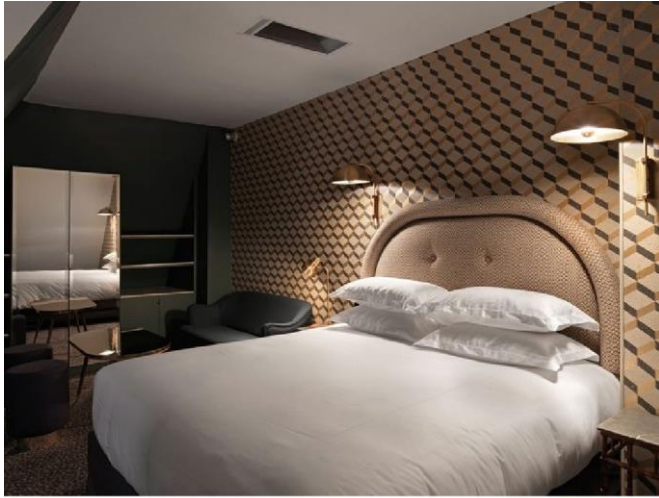
Grand Pigalle Hotel

Meilichzon infused the hotel with a perspective that feels grand and sophisticated with hints of Art Deco, yet it's decidedly modern throughout. Meilichzon's designs continue into Bachaumont's spacious restaurant and intimate bar, which are worth a visit even if you're not staying at the hotel.