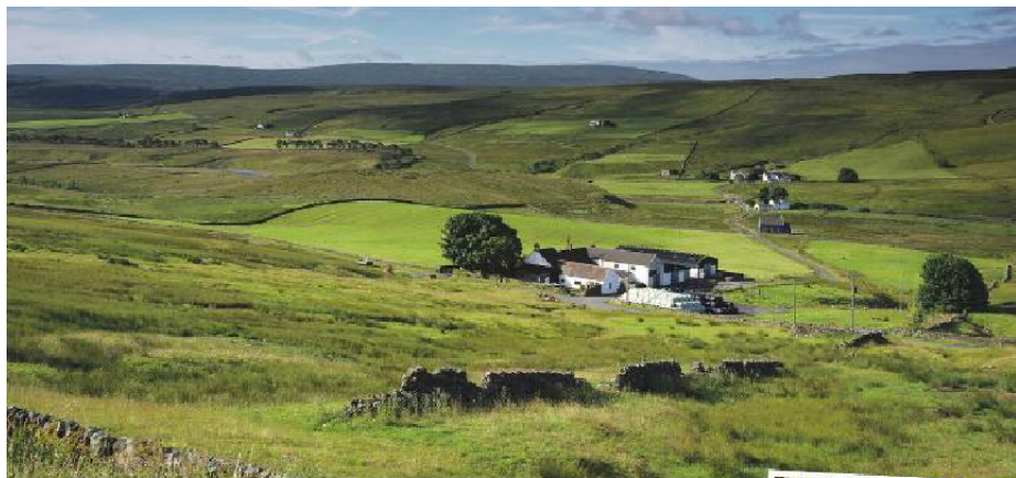
North Pennines Area of Outstanding Natural Beauty